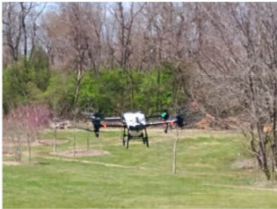
Aerial drone pesticide applications are being considered by some applicators.

T here has been a high level of interest in using unmanned drones to apply pesticides to crops in certain situations. There has also been some confusion in terms of what pesticide certifications are